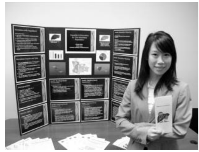
B.S in Nursing, Student Poster Session, Spring 2011

Chapter Founder of ACRP Southern California Site for Association of Clinical Research Professionals (ACRP) Orange County/Long Beach Consortium for Nursing Los Angeles Nursing Consortium Consortium of American Schools, Colleges and Universities California Association of Colleges of Nursing (CACN) American Association of Colleges of Nursing (AACN)