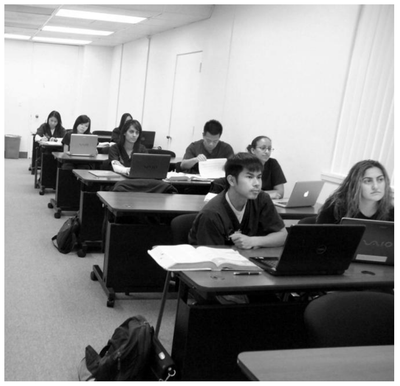
Classroom, Taken During Lecture . School Of Nursing 2010