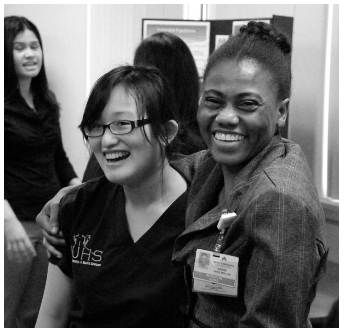
Faculty and Student picture, taken during the School of Nursing Poster Session