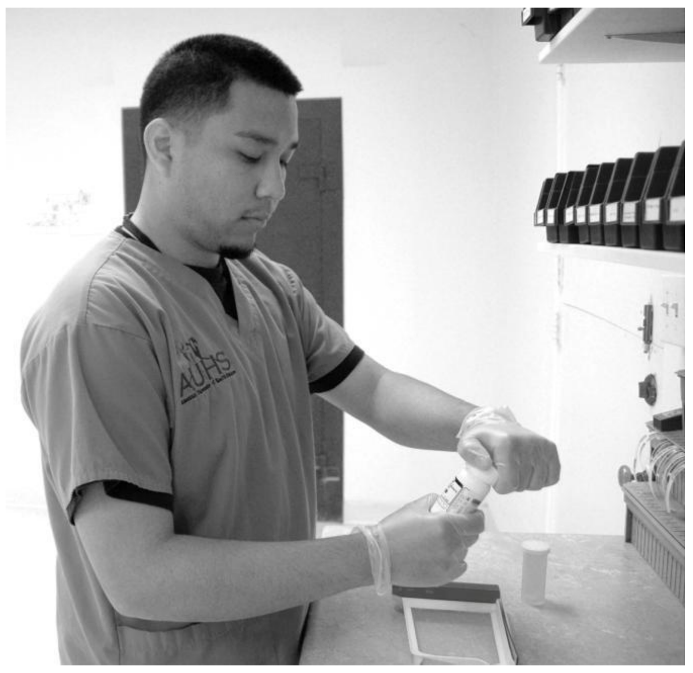
Classroom, Taken During Lab, Pharmacy Technician Program