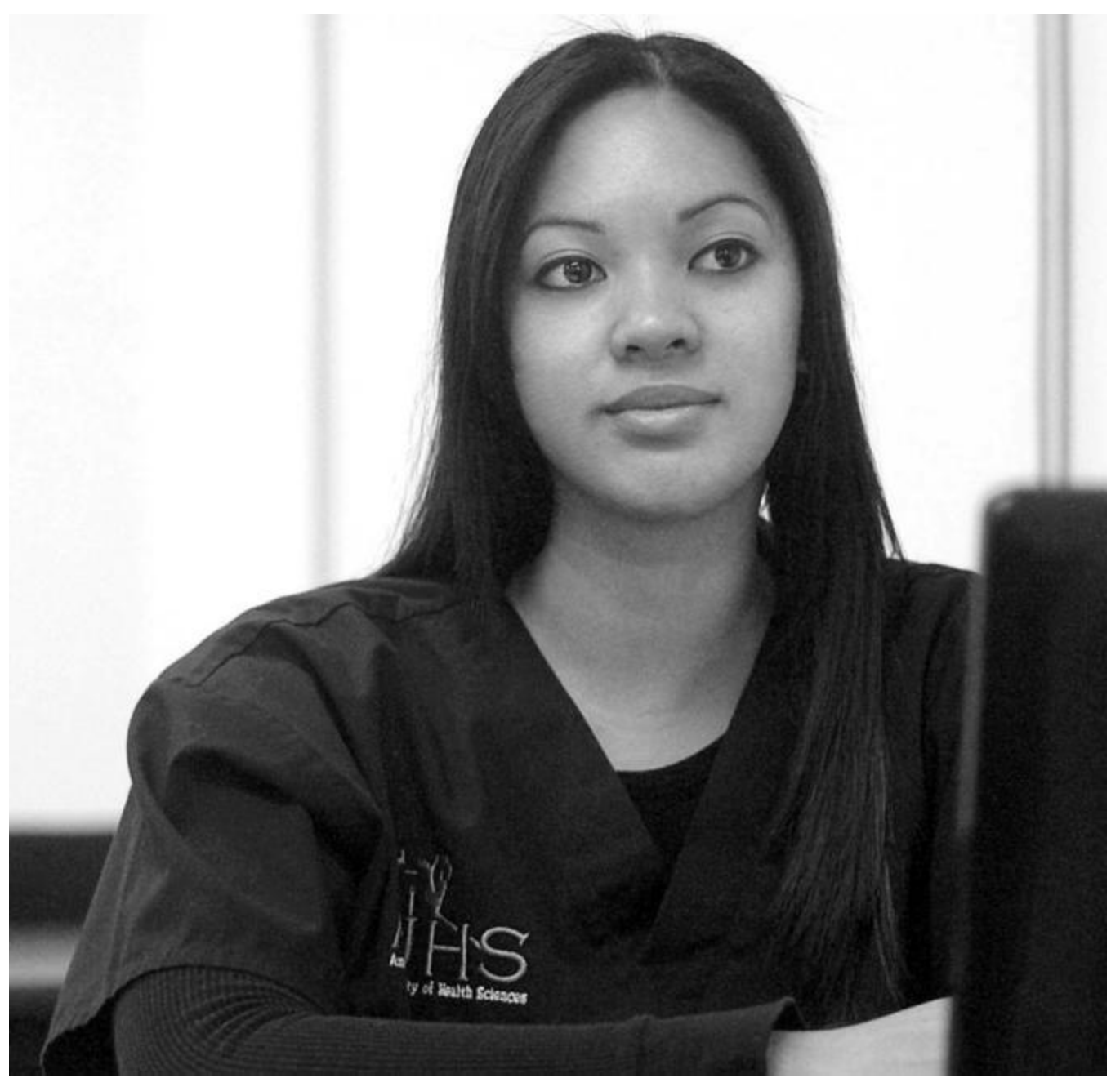
Student, School of Nursing, During Lecture