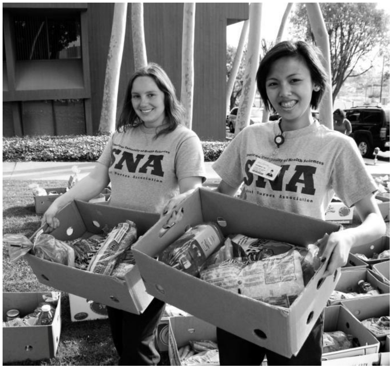
Nursing Students, giving away meals for the "Act Of Love" holiday event

There is a dream that each of us has inside. It speaks of a better time, of a better life, of a better world. There is a voice that comes from God and shows to each, "the way", then says, "come abide." There is a need that cries, must be satisfied, requires of us to care, to help, to give, set self aside. That all might have the chance to believe, to learn, to create, to succeed