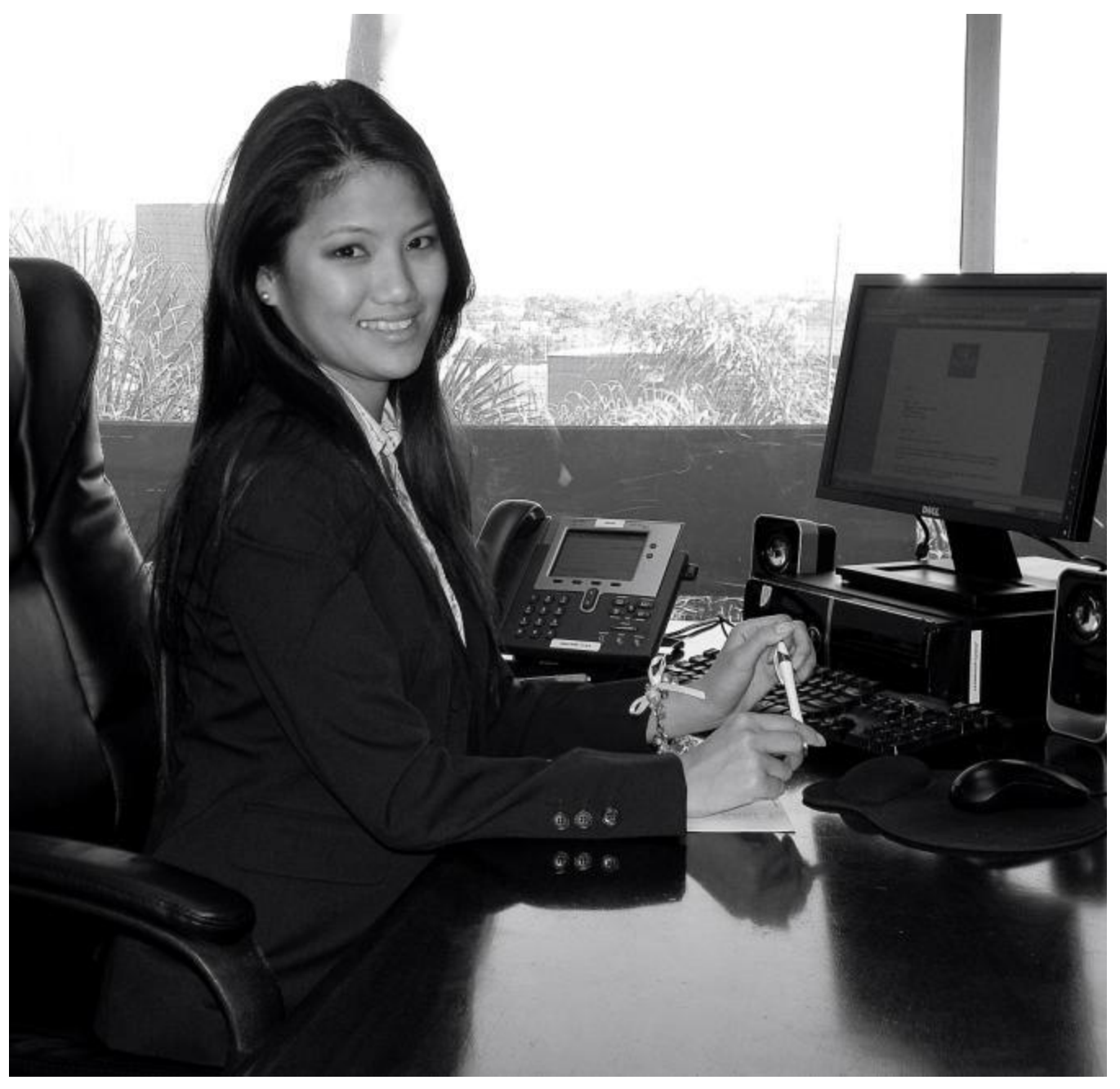
AUHS Career Services Office